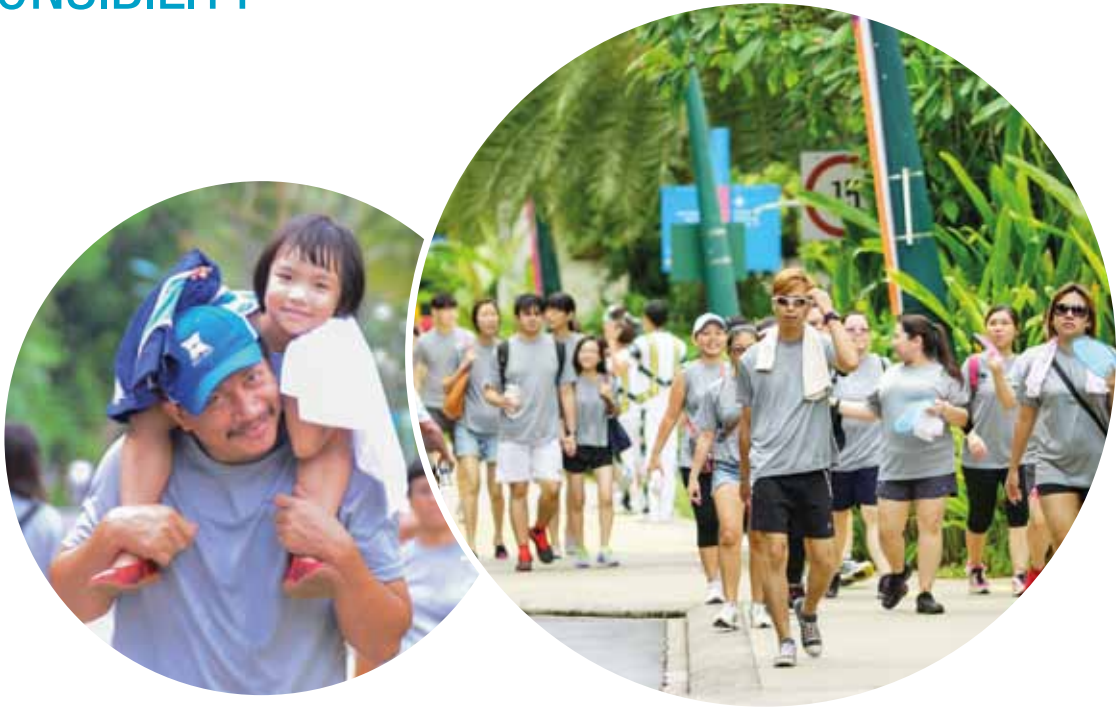
Leukemia and Lymphoma Foundation Walkathon