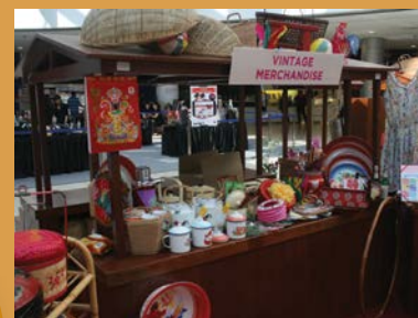
Novena Square Alexandra Retail Centre Westgate