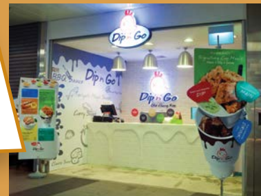
Woodlands MRT Station