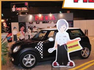
Century Square Choa Chu Kang Xchange